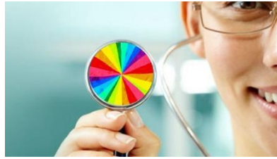
Israeli society for LGBT+ medicine